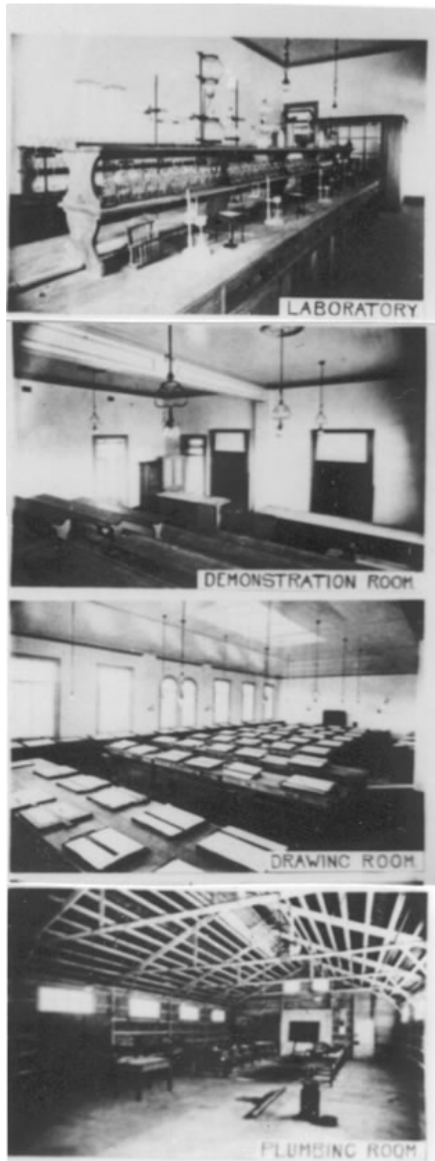
Fig. 31. Science and trades rooms at Mount Morgan Technical College, 1918.