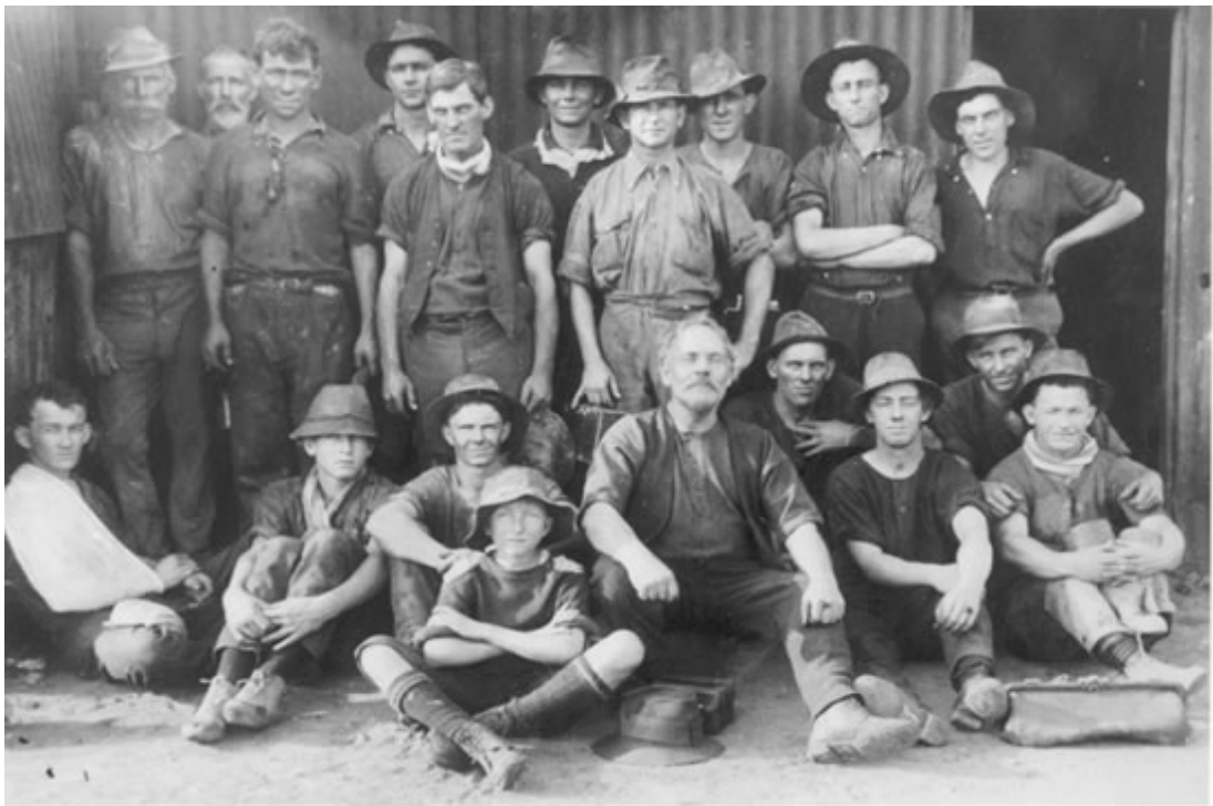
Fig. 28. 'Workmates', 1920. Surface shift, note boys, front row left, hats, crib tins, 'Gladstone' bag.