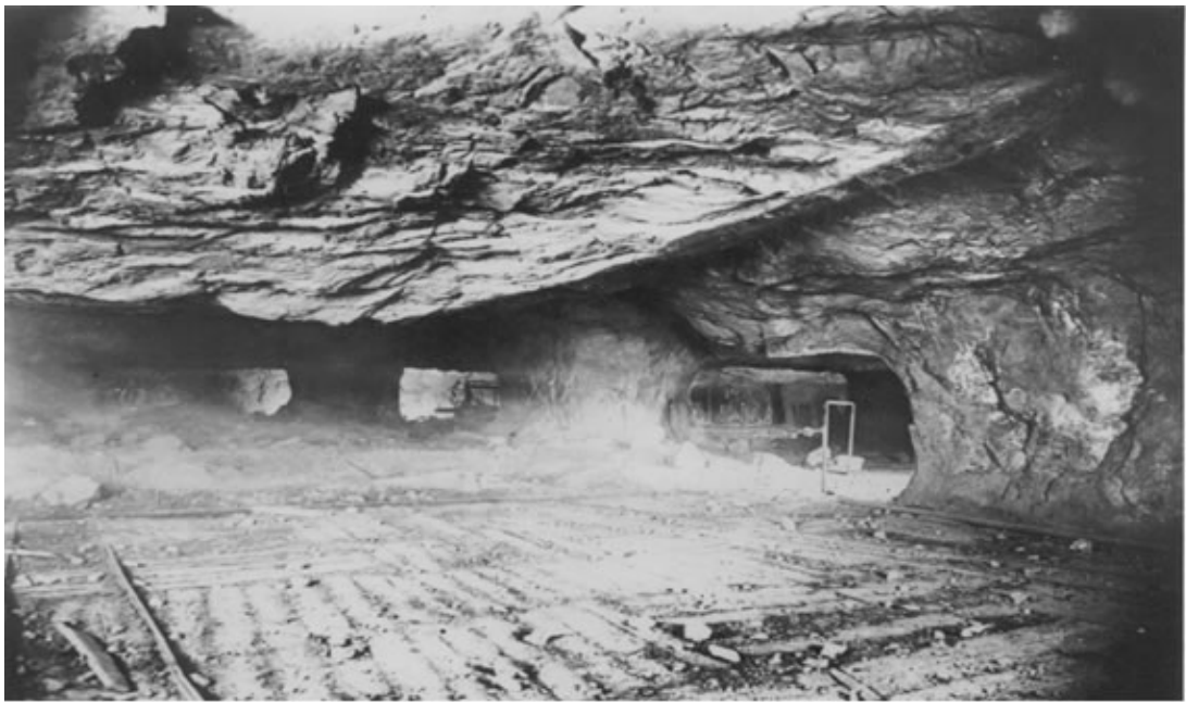
Fig. 29. Underground chamber, pigstye system, at least 750-foot level, timber floor, and unsupported head above. Figures of miners shown in centre and right chambers.

of mining operated at the mine. These included a large open-cut to the 350 foot level, where by 1903, waste material was used to fill the worked out underground chambers. Square set timbering was the method used from the 350-foot level to the 650-foot level. The ore bodies on the 750 foot and 850-foot levels were mined in large open chambers. Less timber was required for the 'pigstye' system than the square set system. This