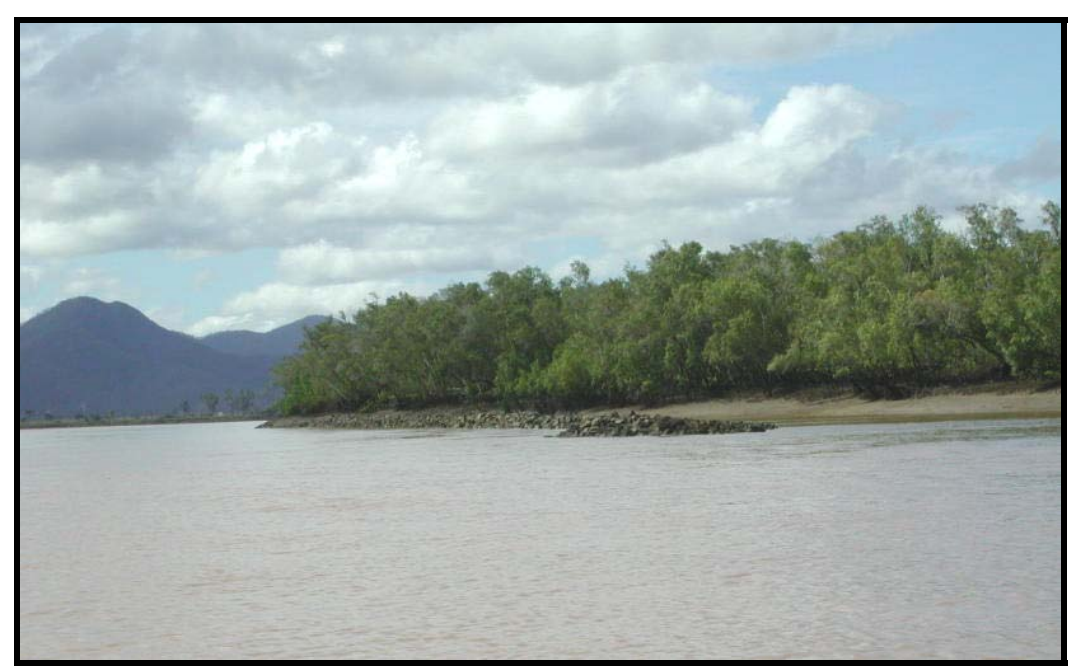
Downstream end of walls around Brown and Goat Islands, northern bank. (Packett, 2/2002)