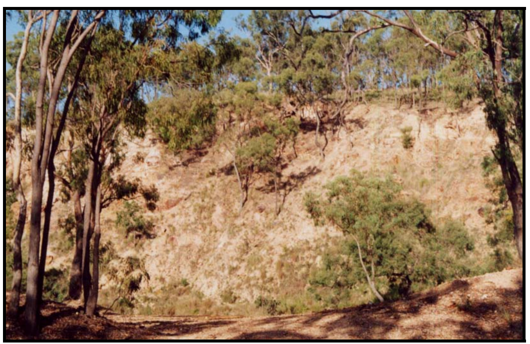
Rockhampton Harbour Board's stone source for later training walls, Lower Quarry, at Thompson's Point on the northern bank of Fitzroy River. (Webster, 6/2002)