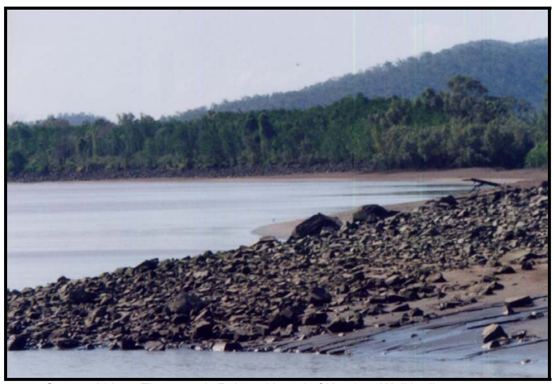
Stone rubble at Thompson's Point, with end of Humbug Wall in distance. (Webster, 6/2002)