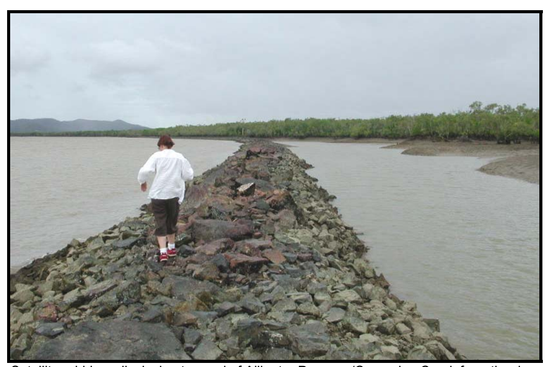
Satellite rubble wall, closing top end of Alligator Passage/Casuarina Creek from the river, looking downstream towards Broadmount.