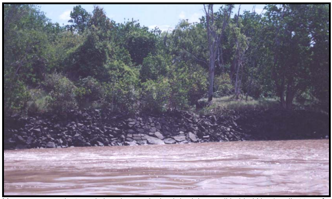
Mangroves, eucalypts and vines have colonised dredging spoil behind No. 1 wall at top of Upper Flats.