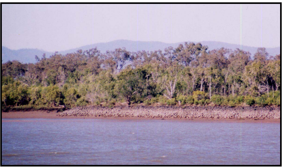
Southern end of The Stone Wall with Dee Range (Mount Morgan) in the distance. (Webster, 9/2002)