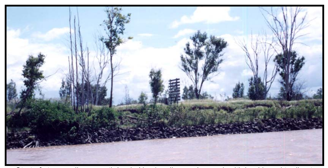
Start of stone walls on south bank, No. 1 wall, now decayed, with lead board to direct pleasure boats up the river. (Webster, 2/2002)