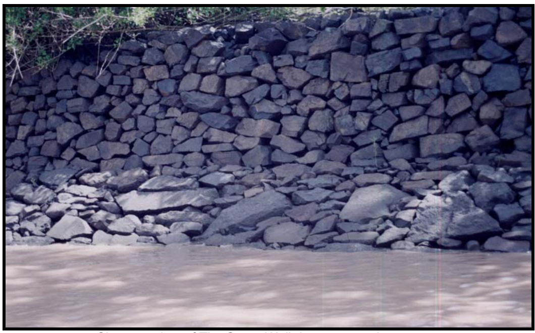
Close-up view of The Stone Wall dry-stone paving.