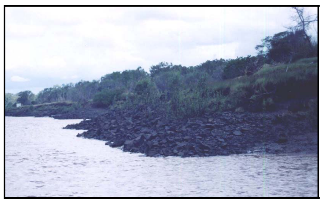
Remnants of stone walls above Prawn Islands.