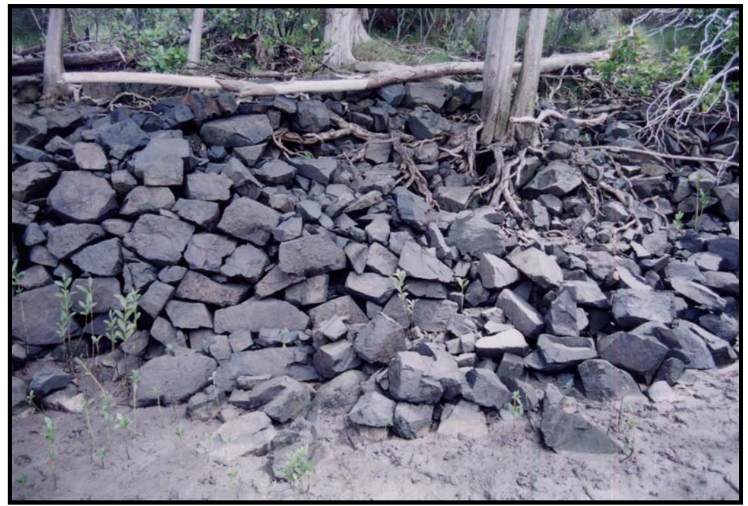
Tree roots breaking stonework.