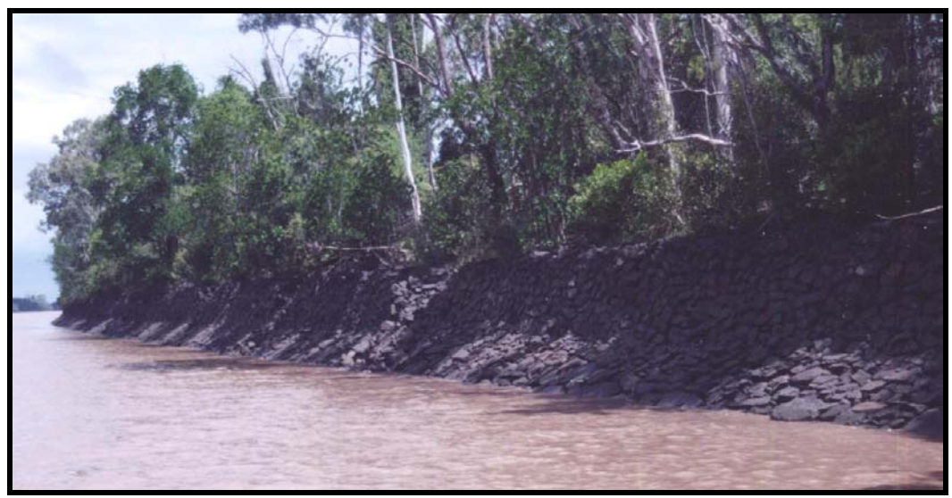
The Stone Wall, looking downstream.