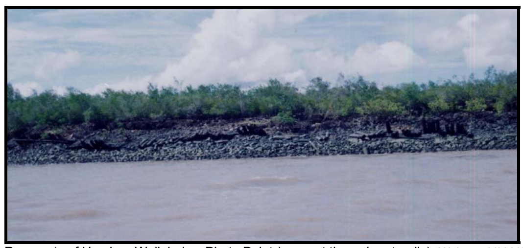
Remnants of Humbug Wall, below Pirate Point (now cut through naturally) (Webster 2/2000)