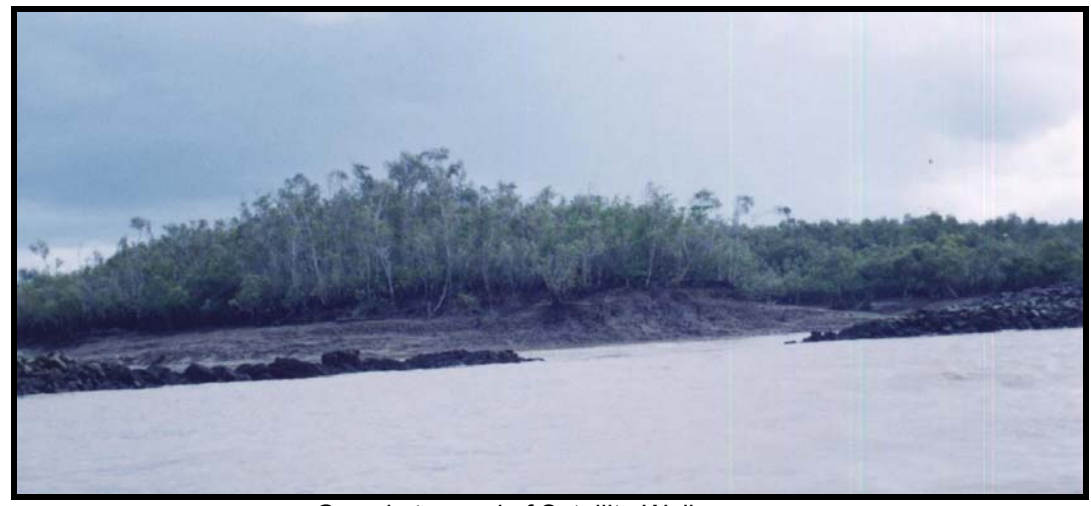
Gaps in top end of Satellite Wall.