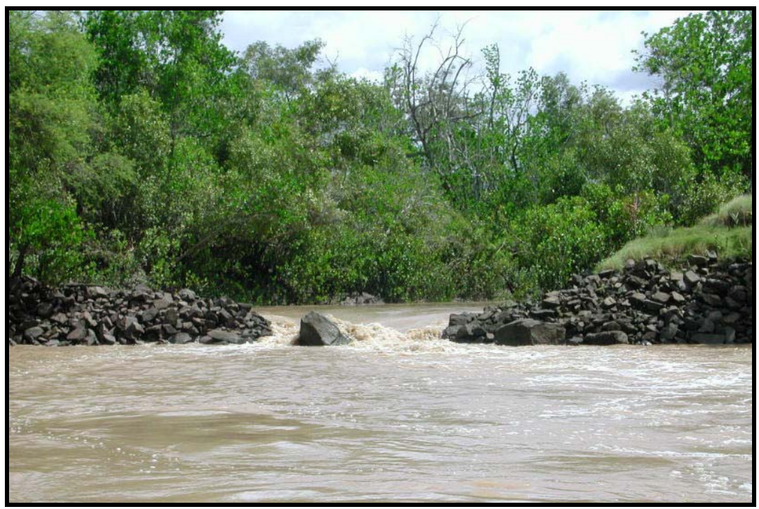
Water escaping from behind No. 1 wall through a gap as the tide recedes.