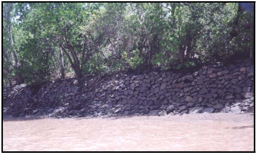
Part of the neatly faced section of No. 1 wall at Upper Flats, commonly known as 'The Stone Wall', opposite the Nerimbera boat-ramp.