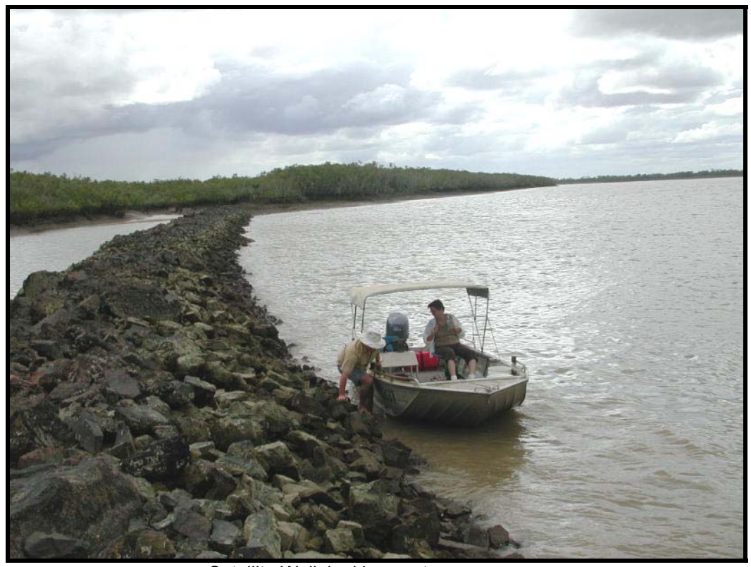
Satellite Wall, looking upstream.