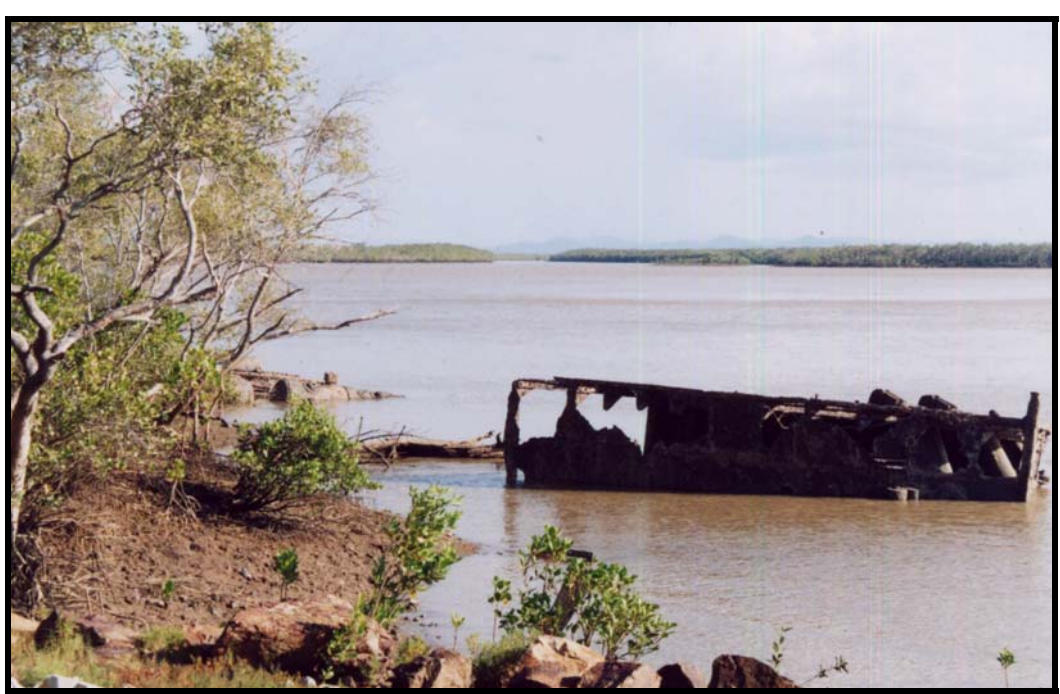
View across Fitzroy River from Thompson's Point to lower end of Alligator Passage. (Webster, 6/2002)