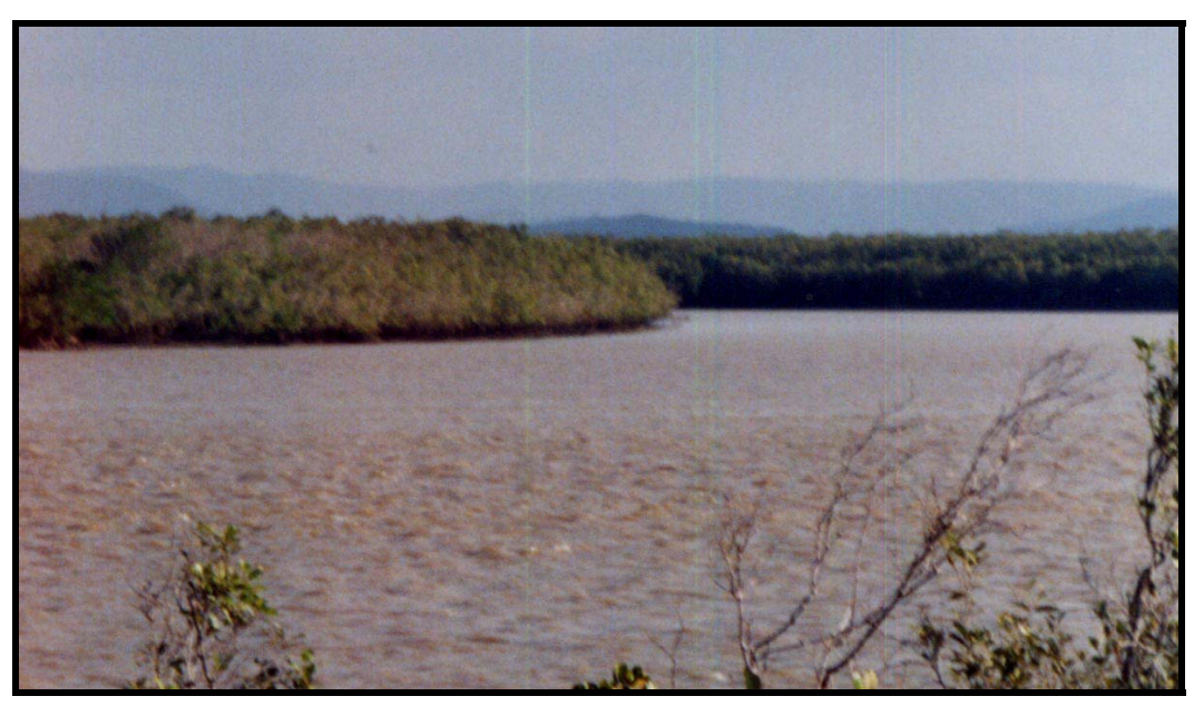
Strong flood tide below Thompson's Point with Alligator Passage opposite. (Webster, 2002)