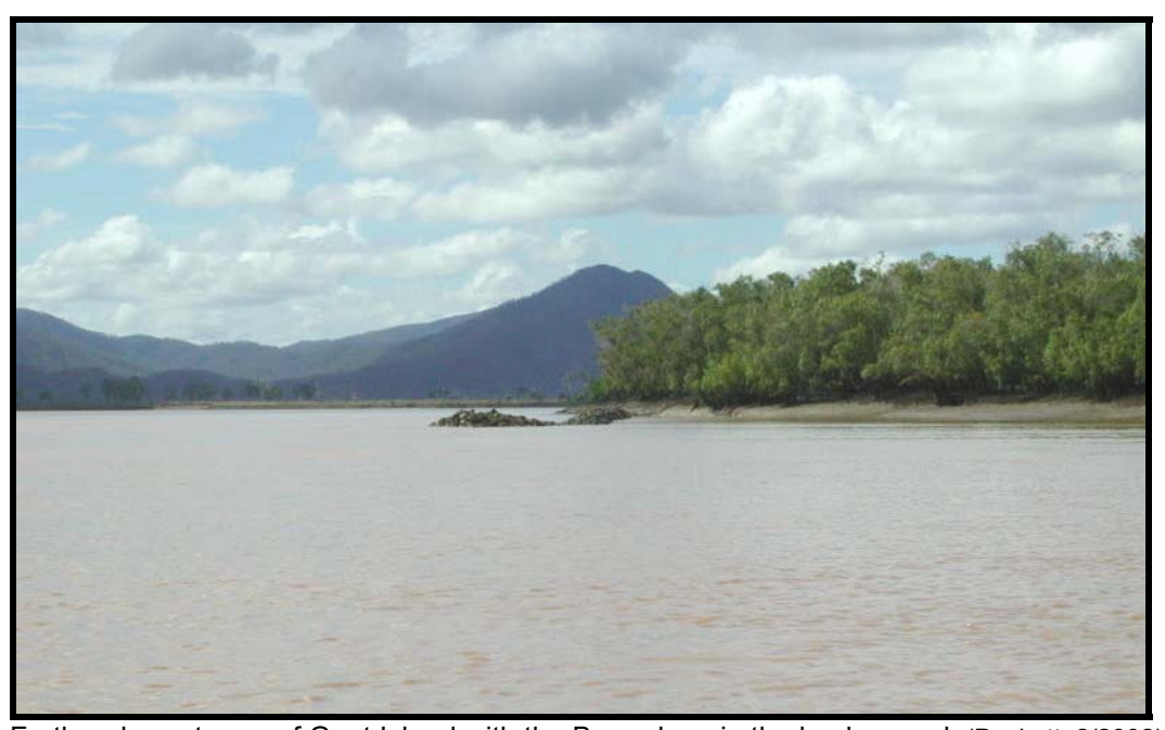
Farther downstream of Goat Island with the Berserkers in the background. (Packett, 2/2002)