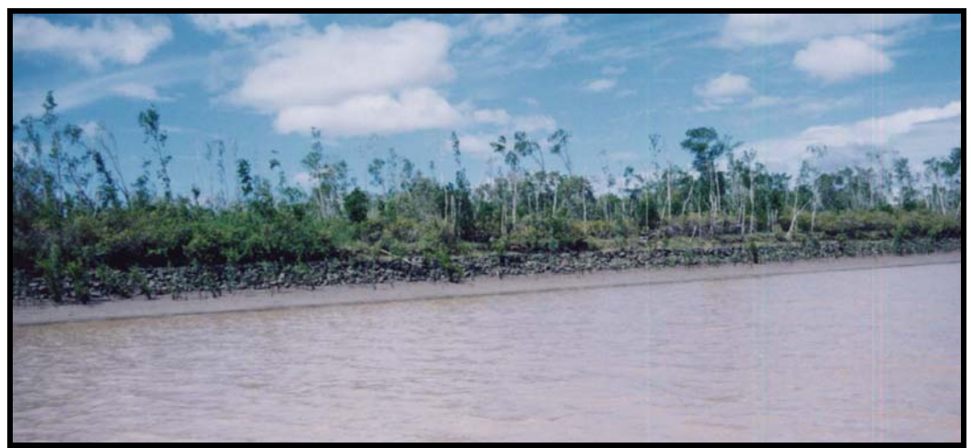
Prawn Islands Wall (No. 3) on south bank.