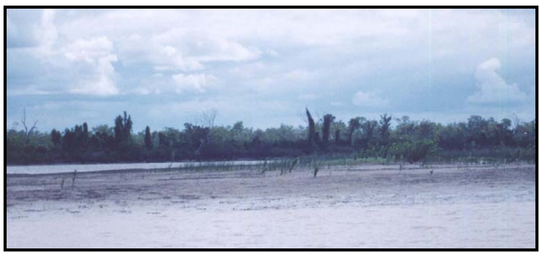
Deposition of sediments and early colonisation by vegetation at Archer's Crossing, the site of great dredging activity at No. 2 cutting below Elbow Sand and Elbow Wall.