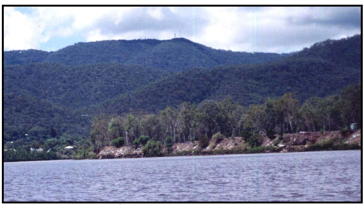
Devil's Elbow, opposite Lakes Creek, the last tortuous curve which boats had to negotiate on the Fitzroy River en route to Rockhampton. Behind are the Berserker Ranges.