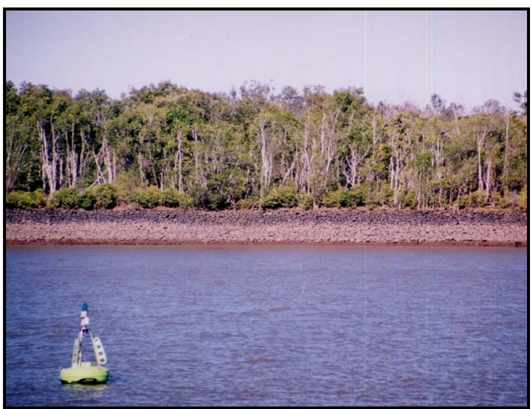
The Stone Wall from Nerimbera Boat-ramp, with densely vegetated in-filled land behind. (Webster, 9/2002)