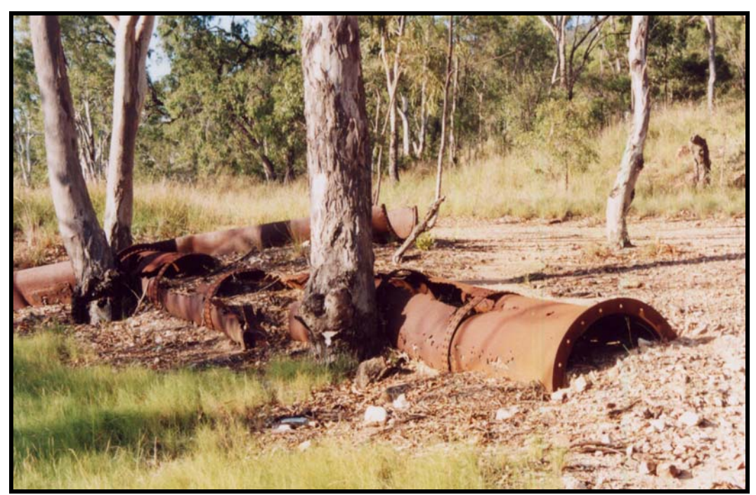
Suction dredge piping discarded at the abandoned Lower Quarry, Thompson's Point. (Webster, 6/2002)