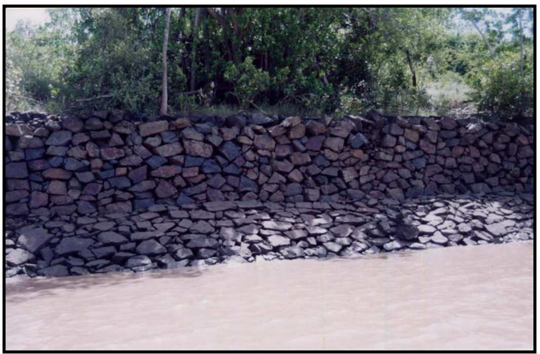
The Stone Wall