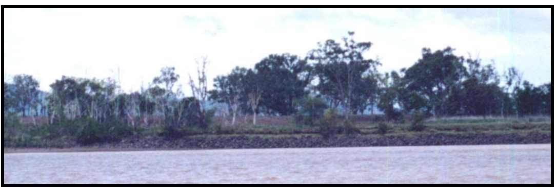
No. 2 training wall along northern bank downstream of Nerimbera boat-ramp. (Webster, 2/2002)