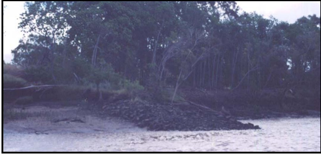
Remnants of walls above Prawn Islands (No. 3 training wall) now washed into heaps (Webster, 2/2002)